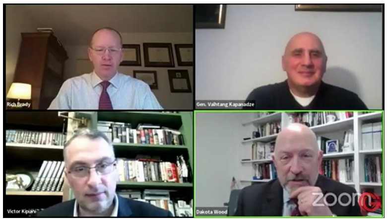
Russia's Demarche: Political and Military Implications

At the end of the webinar, the participants stressed the role of such discussions and dialogue in promoting and bolstering relations between Georgia and Romania, to achieve common goals and objectives. They also expressed readiness to hold similar events in the future.